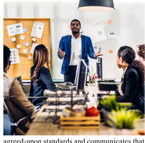
agreed-upon standards and communicates that the team completed the project.

The closing phase. Finally, the project manager ensures the team completed the project to the